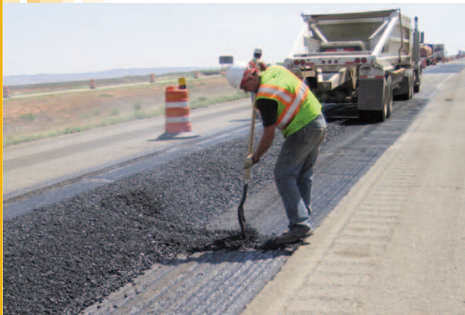
The GlasGrid System allowed the contractor to make repairs quickly using temporary, one-day lane closures.

The GlasGrid Advantage: The GlasGrid System is the leading reinforcement interlayer system for pavement overlay design. It has been successfully used within asphalt overlays on highways, airport aprons, runways and parking lots across the world. Reflective cracking initiated by thermal loading, lane widening, asphalt construction