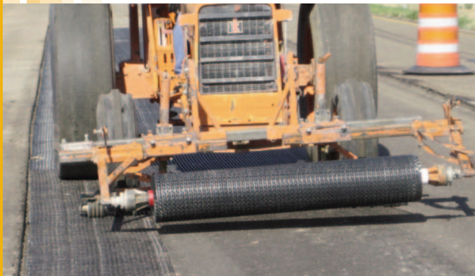
The GlasGrid® System saved the New Mexico DOT $500,000 in direct costs.

The Challenge: Located in a growing area that was also a popular tourist destination, the repairs had to be completed quickly with minimum traffic disruption. The budget precluded lane widening or the construction of detour lanes.