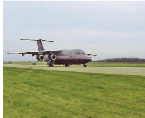
A follow up field survey in 2007 showed the GlasGrid repairs were performing to a high standard.