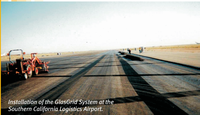
Installation of the GlasGrid System at the Southern California Logistics Airport.

Application: The City of Victorville operates the Southern California Logistics Airport (SCLA) at the site of the former George Air Force Base. The SCLA is a dedicated air cargo facility that includes