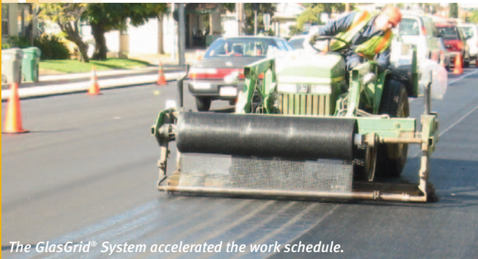
The GlasGrid® System accelerated the work schedule.